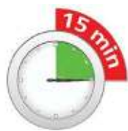
Wait 15 minutes