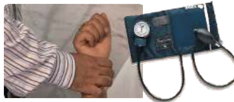
Take pulse & BP