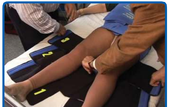
If no change >20 in pulse or BP, open segment pair #3