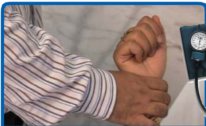
Take woman's pulse & BP

Always wear gloves when touching a soiled NASG.