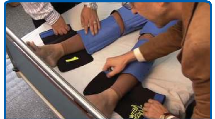
Open segment pair #1 (#2 for short women)